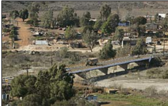
In Colonet, a bus crossed over the San Rafael River, which empties into the ocean at Punta Colonet when the river is flowing.