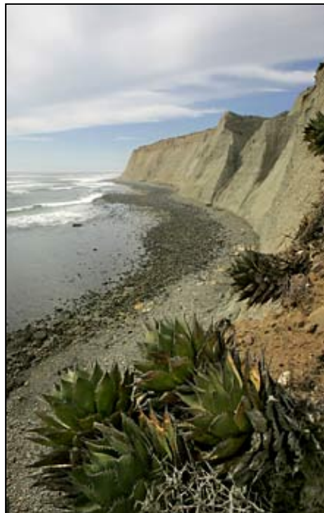
Punta Colonet is likely to be transformed over the next decade into a megaport that will help to handle the increasing amount of cargo coming from eastern Asia.

"We have purchased 2,500 hectares (more than 600 acres)," Ruffo said. "We've spent about $3 million so far. That shows how serious we are."